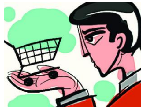
Real estate portal Housing.com is in talks to acquire two more startups as it looks to increase its technology and data analytic capability.

BENGALURU: Real estate portal Housing.com is in talks to acquire two more startups as it looks to increase its technology and data analytic capability. The Mumbai-based company is negotiating terms with Realty Business Intelligence, an information portal focused on the realty industry and Nestaway Technologies, an online marketplace for shared accommodation for singles, according to two people directly involved in the discussions.